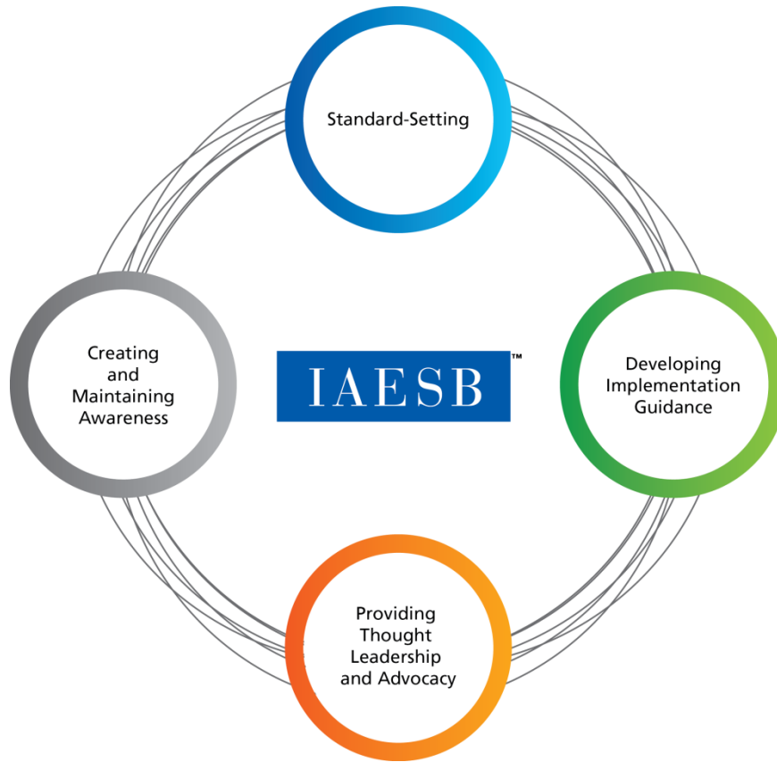
FIGURE 1: IAESB Activities